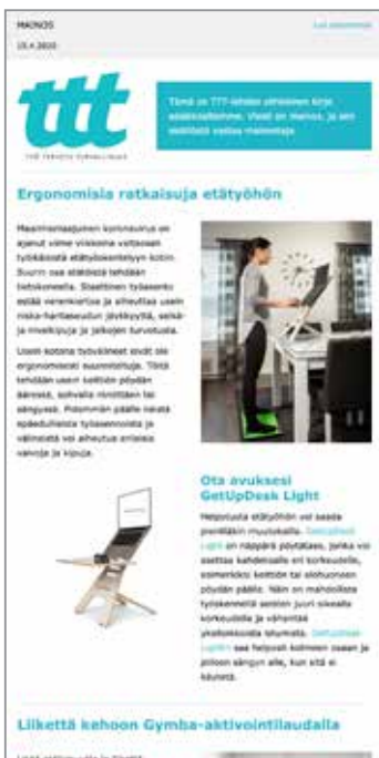
Screenshot presents top part of ErgoFinland's direct e-mail.

Job advertisements are part of our services. The newsletter and website Openings Column reach especially occupational health managers and professionals in work well-being. Follow-up report is included in the advertisement rate.