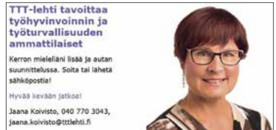
Text appr. 300 characters