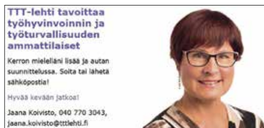
Text appr. 300 characters